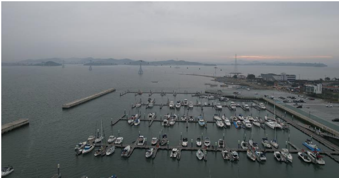
< Jebu Marina (2021) – West sea >