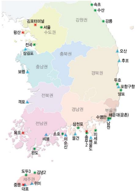
< The 1 st Marina Port Master Plan('10-'19) >